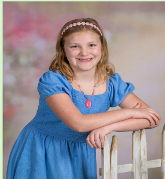
Sample of this spring's background